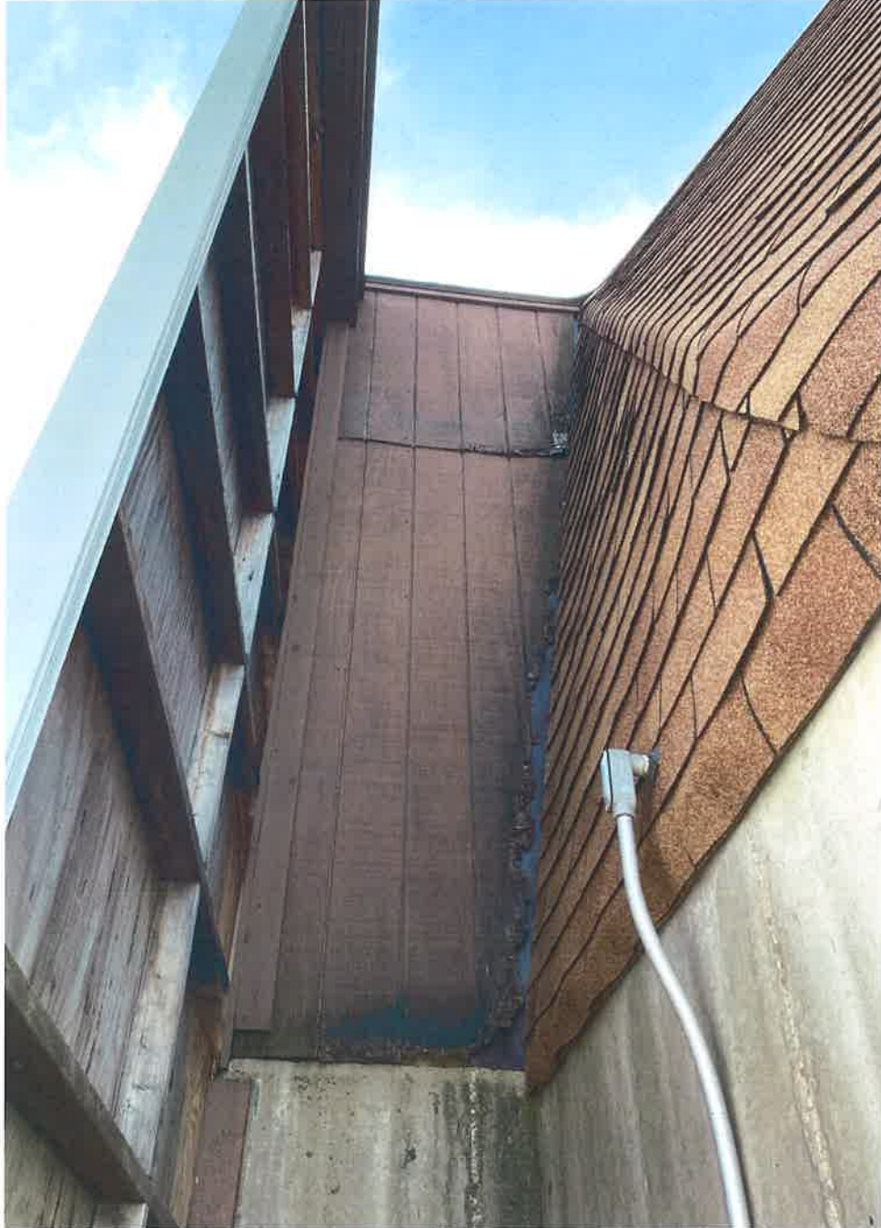
MONEE SALT DOME PHOTO # 3