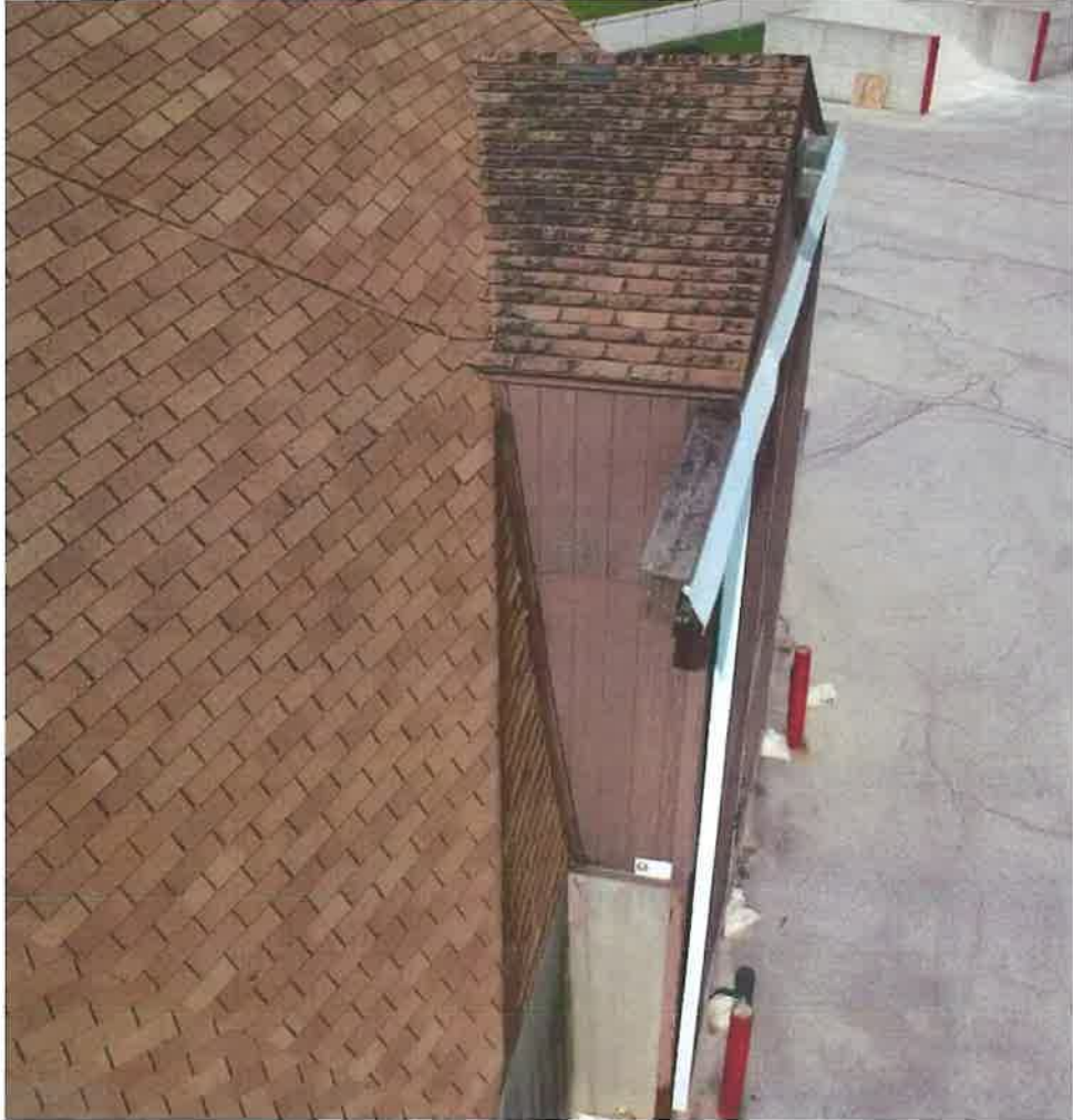
MONEE SALT DOME PHOTO # 1