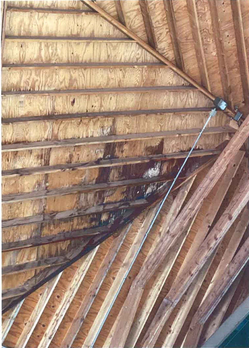
JOLIET SALT DOME PHOTO # 2