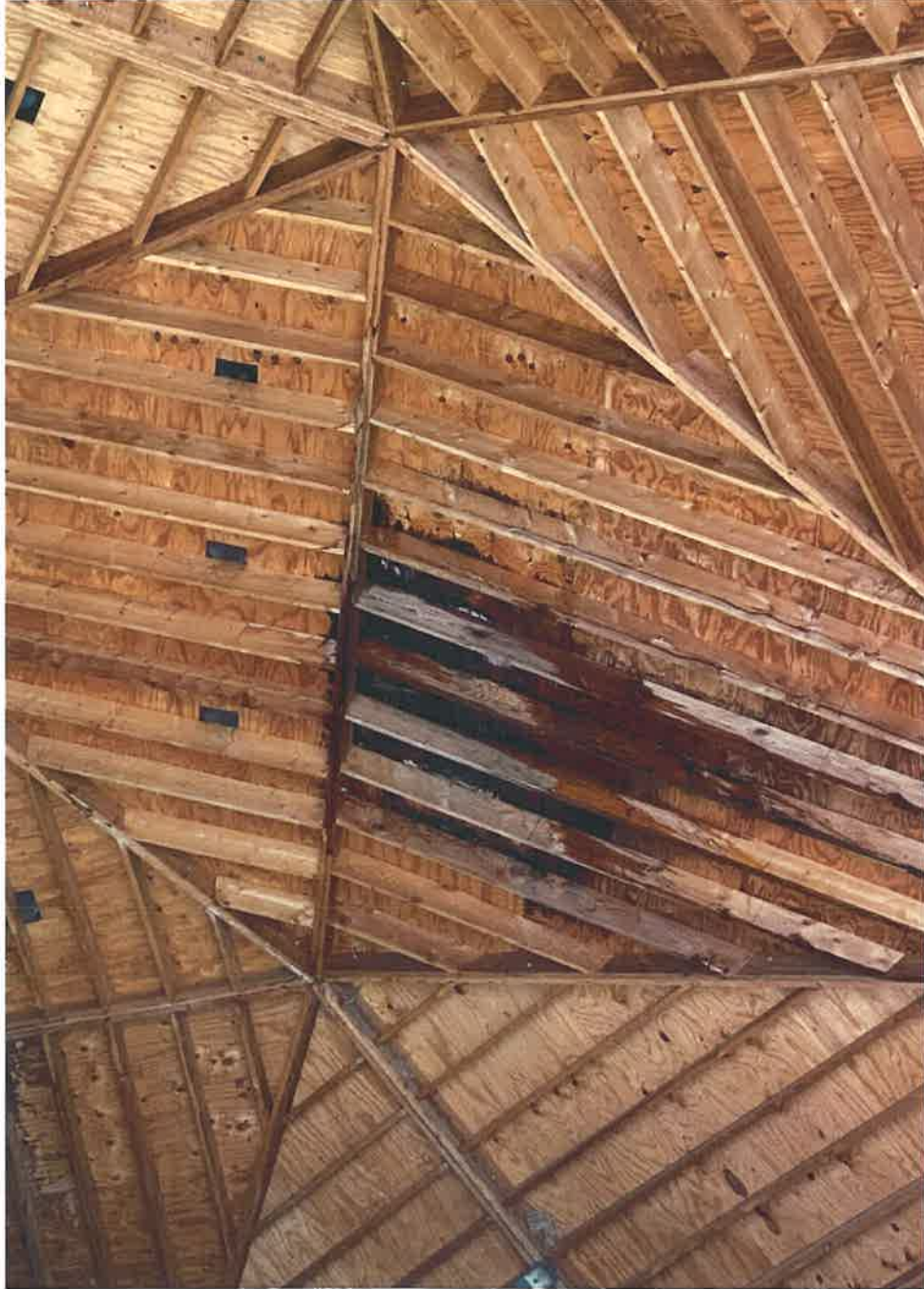
JOLIET SALT DOME PHOTO # 1