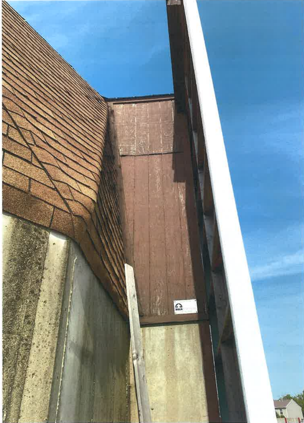
MONEE SALT DOME PHOTO # 2